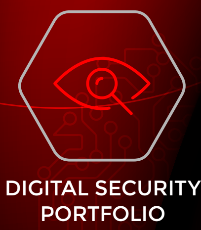
DIGITAL SECURITY PORTFOLIO

This step change in digital security doesn't just prevent fraud, it also presents compelling savings for your business